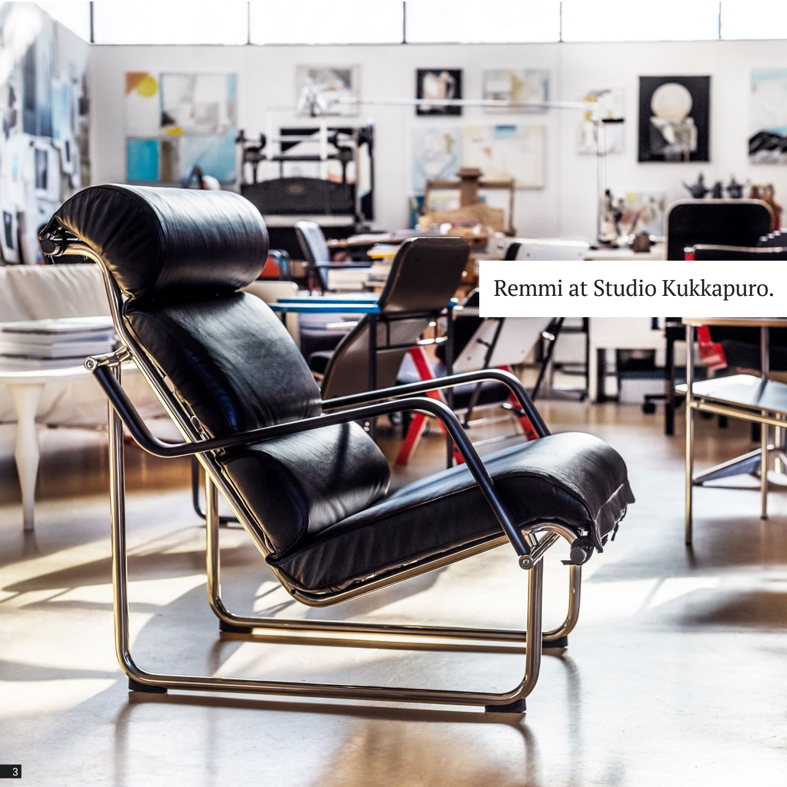
Remmi at Studio Kukkapuro.