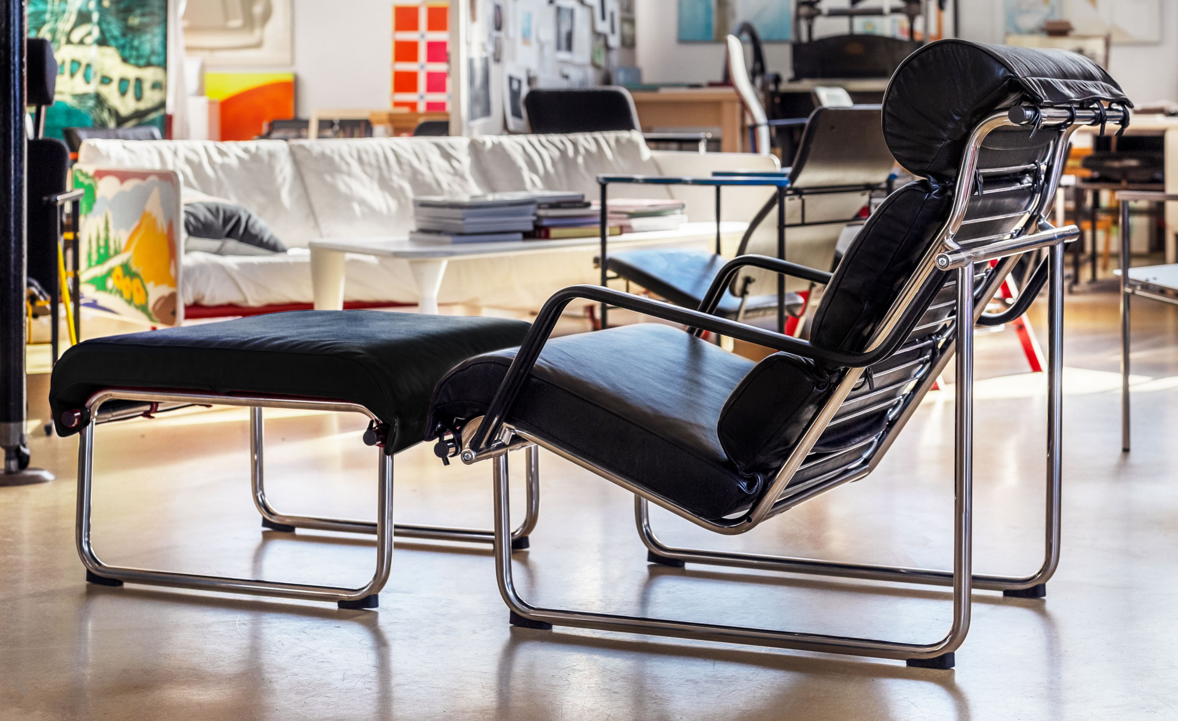
Meticulous care has been taken to make sure that the parts are interchangeable with the original parts now and in the future.

“All the parts are the same as they were originally”